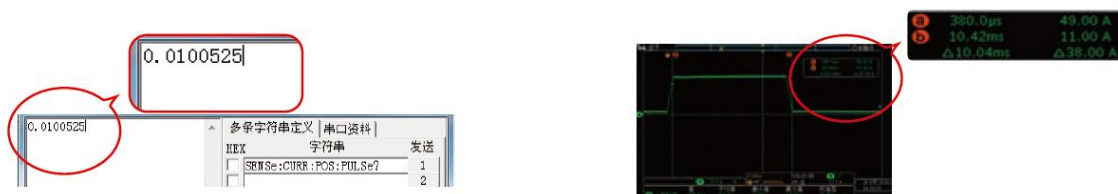
Fig 3. Time Measurement Comparison between IT8900A and oscilloscope

IT8900A/E series load comes with time measurement function, with accuracy comparable with oscilloscope.